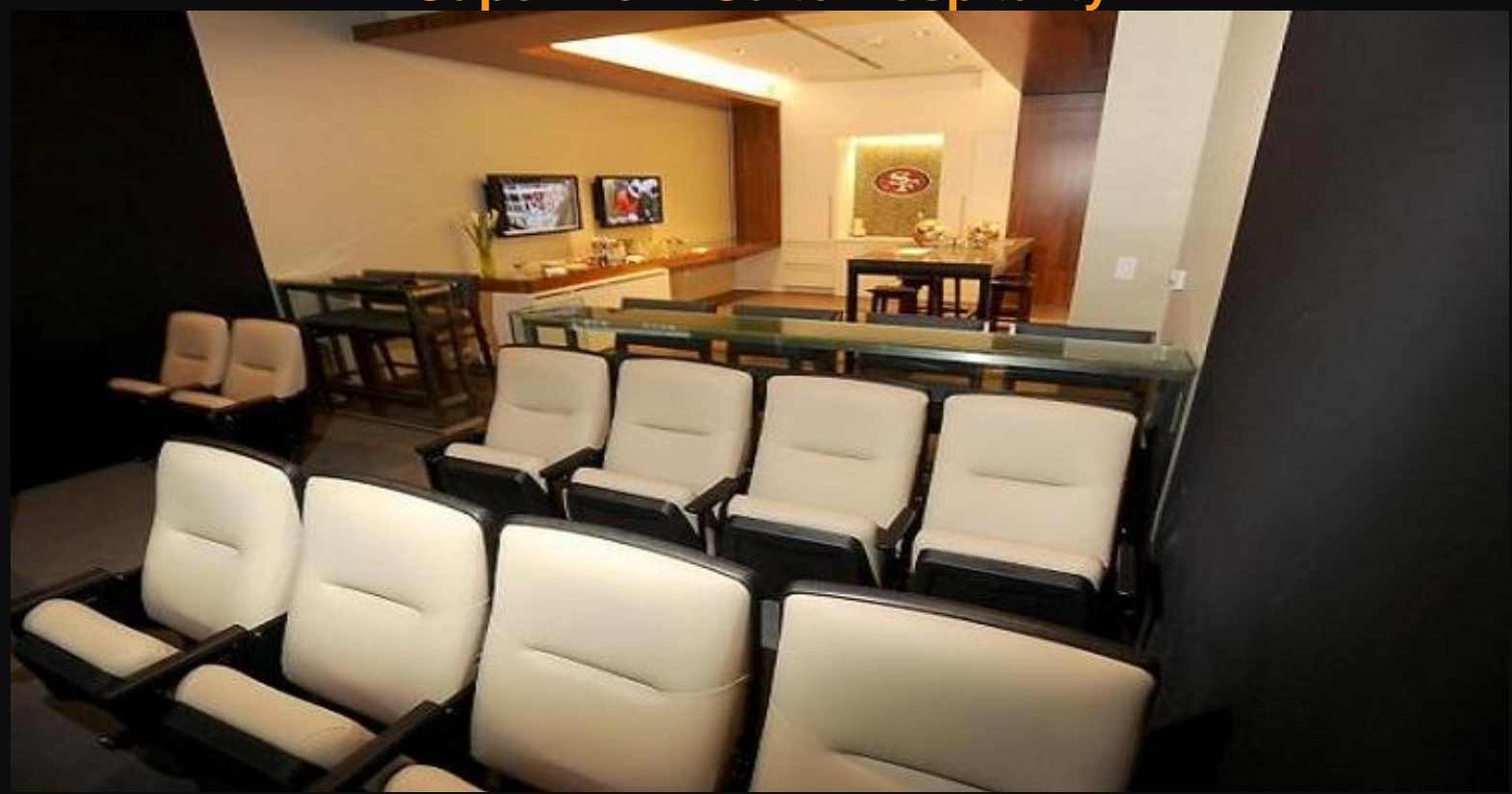
Enjoy fine dining and premium beverage service throughout the day