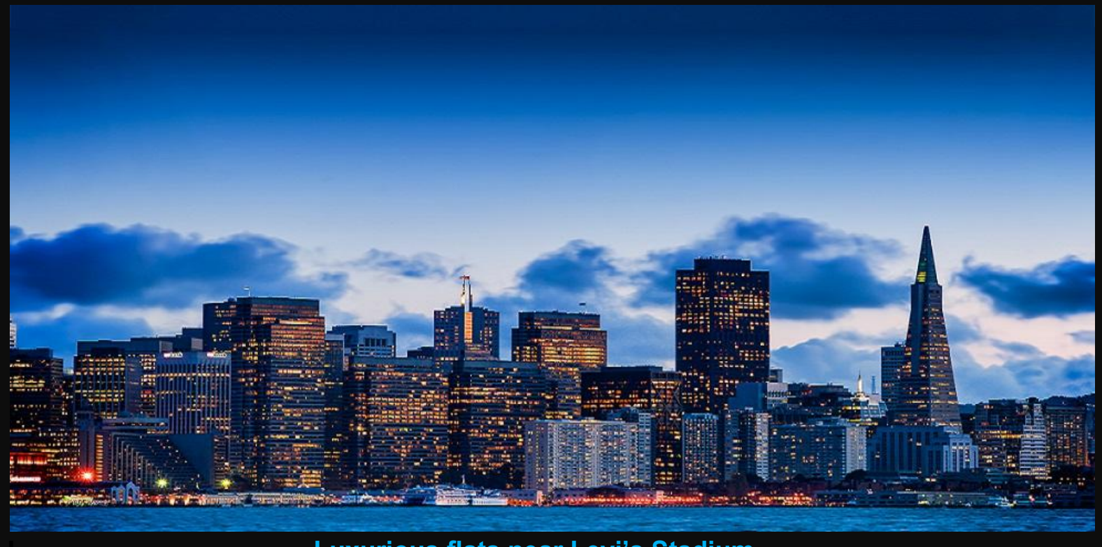
Luxurious flats near Levi's Stadium

Included in the Shared Suite Hospitality packages, a 4 nights stay at a fully furnished luxury flat, only 5 minutes from the stadium. Discover San Francisco with VIP's Access concierge assistance during the Super Bowl week while enjoying exclusive access to the best this fabulous city has to offer.